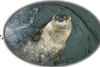
Native species like cutthroat trout, beaver, blue heron, and river otter find their homes along Amazon Creek