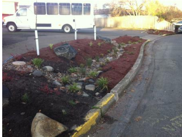
This stormwater swale replaces excess asphalt to slow and treat runoff pollution from a parking lot before it gets to Amazon Creek.

Our goal is to work with local businesses to enhance urban landscapes while at the same time reducing waste from chemicals and inefficient irrigation, and treating and reducing stormwater runoff onsite with rain gardens and bioswales