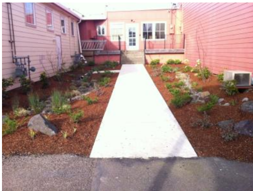
Turf area converted to swales to treat stormwater before heading to Amazon Creek