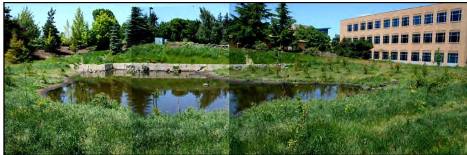
Thermo Fisher Scientific removed a 3 story building with plans to fill it in with lawn. Thanks to employees who went through BRING's Re-Think program who reached out to LTWC, we created a swale, retention pond and upland meadow that supports wildlife and cleans an acre of stormwater before it flows into Amazon Creek.