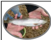
This Cutthroat Trout was found in Amazon Creek! Improving water quality and habitat can benefit this important native species. The plants pictured on this page are natives that are beautiful and require little maintenance or water to thrive.