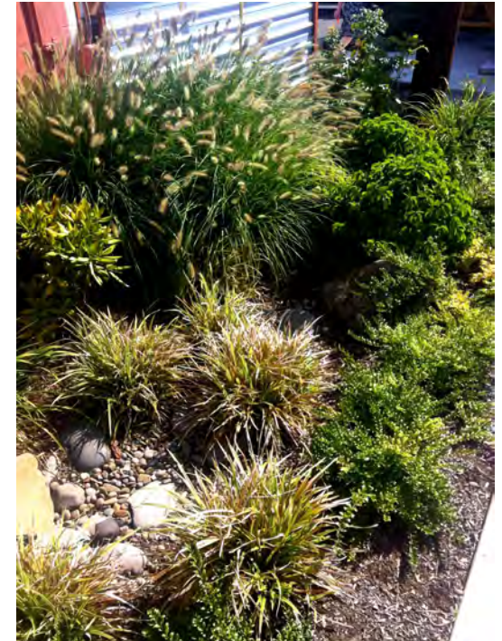
Detail of swale at Davis Properties.

Enhance your landscape, attract customers, improve our local waterways, and provide habitat!