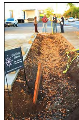
Joe's Garage is installing a rain garden that will manage all of the stormwater from their new parking and garage.