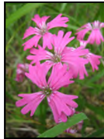
(above) Signage for participating businesses that meet objectives in the Trout Friendly Landscapes Pledge