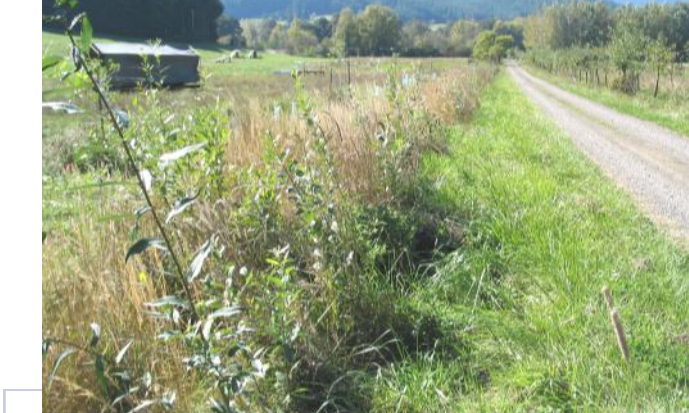
After the project: The blackberry were removed and replaced with native trees and shrubs. In this section, the channel was reconstructed with stream rock and log weirs. The channel cross-section is wider and shallower, which decreases erosion and improves floodplain connectivity.