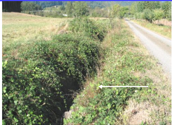
Before the project: The existing channel was deeply incised and lined with non-native Himalayan blackberry.

This project was funded by the landowner and a grant from the Oregon Watershed Enhancement Board. In addition, Council volunteers from Lane Community College and the University of Oregon donated many hours of time planting willow stakes, trees and shrubs.