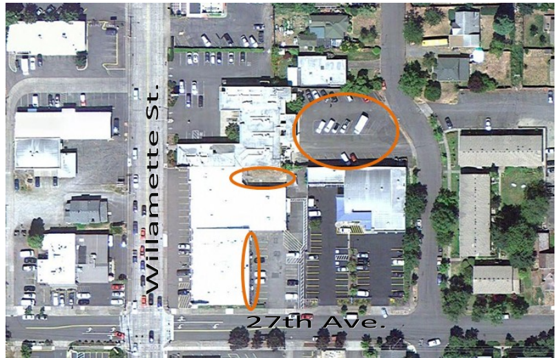
Project Site with 3 locations identified for retrofitting