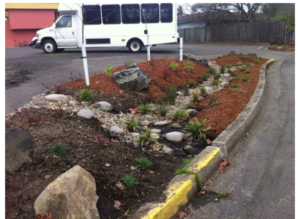
Parking lot — After

Economic: Attractive landscapes help to maintain tenants, bring new customers, and provide a pleasant experience.