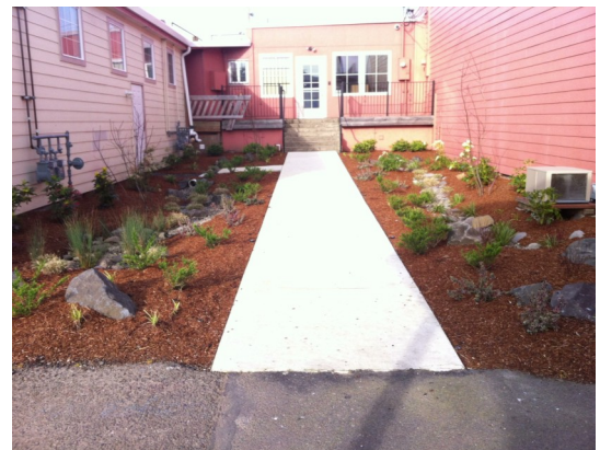
Rain Garden — Woodruff Landscaping

Long Tom Watershed Council: 541-338-7042, jschmidt@longtom.org