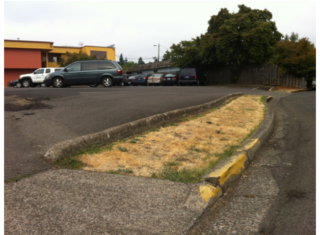
Parking lot — Before

A new bike shelter will incorporate a vegetated roof that reduces runoff from impervious surfaces