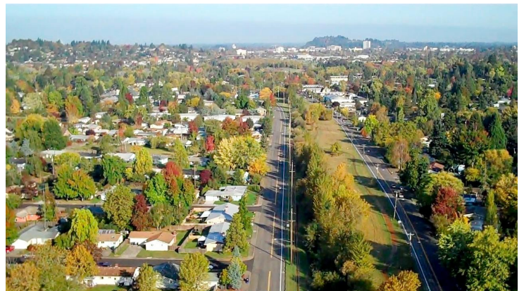
Amazon Creek in South Eugene

Reducing and treating runoff from our properties contributes to a healthier and safer Amazon Creek. The management techniques used on the South Willamette Retrofit Project can be replicated on commercial, industrial, and residential properties. This project is designed to showcase inexpensive and simple solutions.